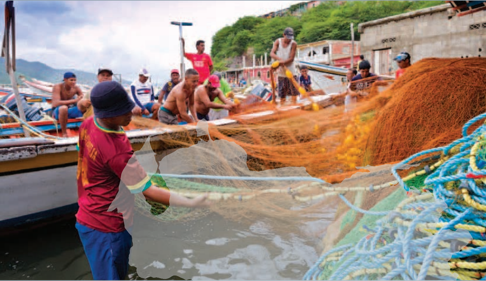
FISHERMEN PREPARING THEIR BOATS, MARGARITA ISLAND

Growth in oil production slowed in the 1960's, but Venezuela's appetite for revenues did not. This appetite was only partly slaked by an increase in royalties negotiated with the oil companies. The government also tightened conditions for foreign direct investment, requiring partnership with Venezuelan interests. Like most countries during this period, Venezuela was inching toward a policy of total nationalisation of oil and gas.