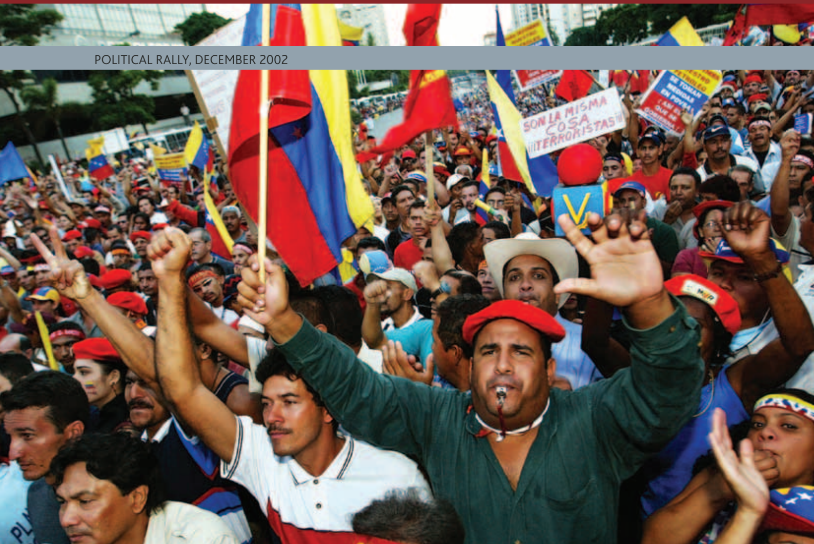
POLITICAL RALLY, DECEMBER 2002

By this point, any chance of rapprochement with Washington was gone. Chávez aggressively promoted ties with Cuba, Nicaragua, Bolivia, Ecuador and the Caribbean through his Bolivarian Alliance for the Peoples of Our America (ALBA), dangling discount oil as bait to join the anti-American coalition. Sticking to the principle that "my enemy's enemies are my friends", he used any available excuse to make common cause with Russia, China and Iran. He also reached out to centre-left governments in Brazil and Argentina, joining the Mercosul free trade pact and opposing US efforts to negotiate a free trade agreement spanning the Americas.