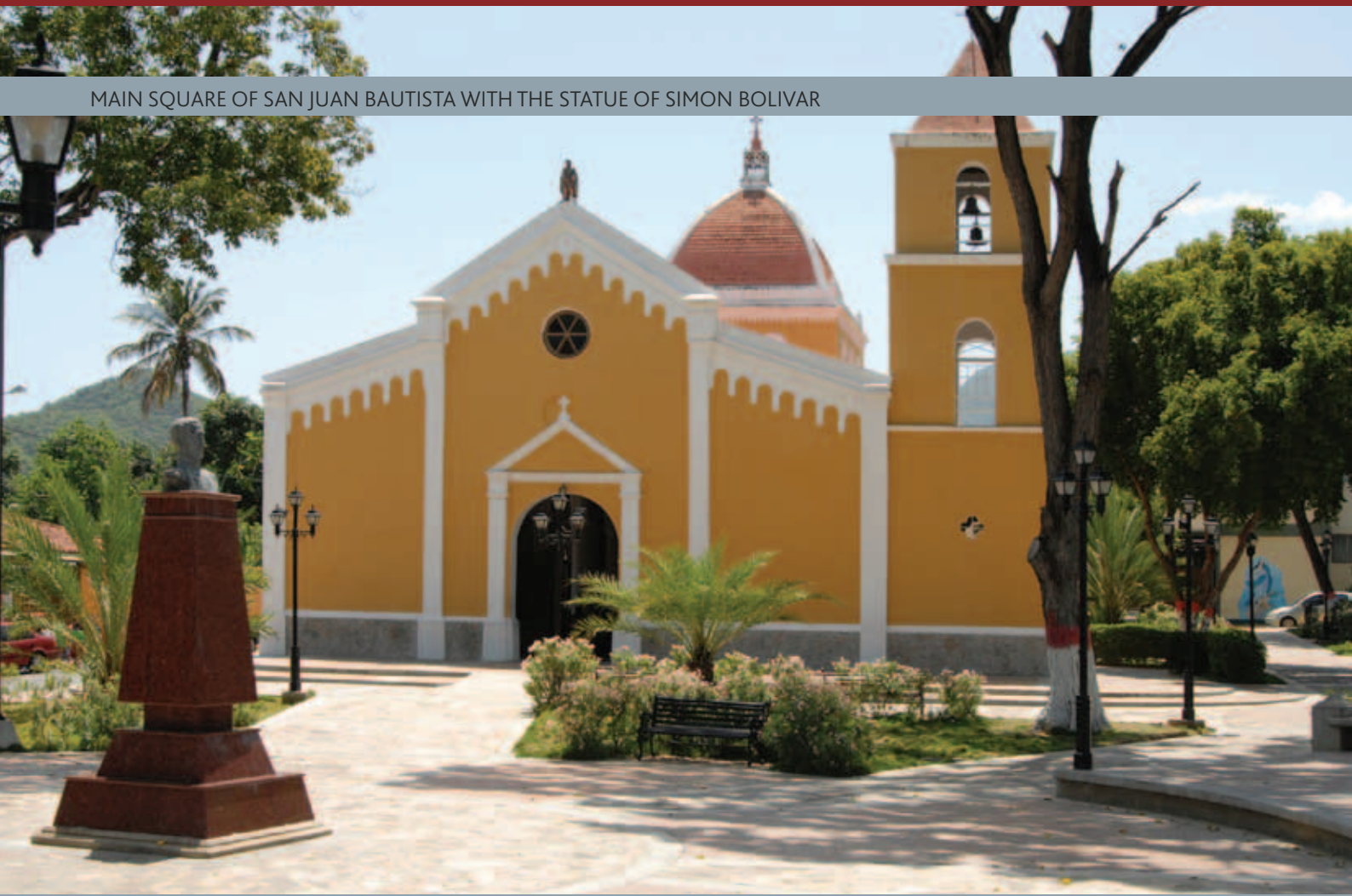
MAIN SQUARE OF SAN JUAN BAUTISTA WITH THE STATUE OF SIMON BOLIVAR