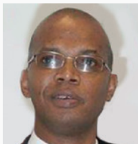
Hon. January Yusuf Makamba Deputy Minister for Communication, Science and Technology, Government of Tanzania

January Yusuf Makamba is a Tanzanian CCM politician and has been Member of Parliament for Bumbuli constituency since 2010. He is